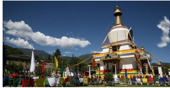
National Memorial Chorten

Continue to the Heritage Museum , dedicated to connecting people to the Bhutanese rural past through exhibitions of artefacts and rural households. See the National Memorial Chorten , built in honor of the late King Jigme Dorji Wangchuk.