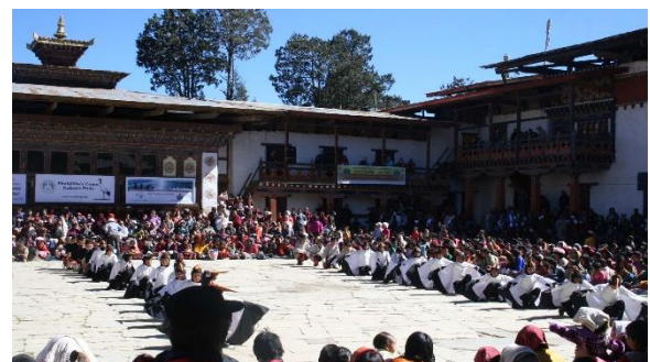
Black Necked Crane Festival

At the Black Necked Crane Information Centre you can find informative displays about the creature and environment. Housing powerful spotting scopes that can be utilized along with a rich library and handicraft shop that usually show videos from 10 AM – 3 PM.