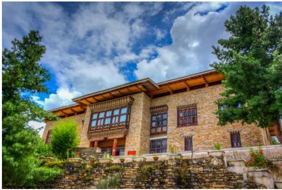
National Museum of Bhutan

For those who are up for it, hike uphill for approx. 01hrs to visit the monastery, afterwards retrace your steps back to the base where your driver shall be waiting to escort you to the 7 th century Kichu Lhakhang and National Museum of Bhutan . Kichu Lhakhang is tucked away just a few minutes drive from the main town of Paro, one of the oldest monasteries in Bhutan.