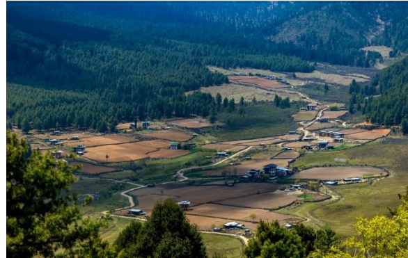
Valley of Phobjikha

After breakfast you will be guided to Valley of Phobjikha , famous for being home to the Black Necked Crane (Grus Nigricollis). Bhutan is home to around six hundred Black Necked Cranes, Phobjikha is popular for birds migrate to in the winter months from the Tibetan plateau. The elegant and shy birds can typically be observed from early NOV to end MAR. Overlooking Phobjikha Valley is Gangtey Goenpa , an old 17 th century monastery.