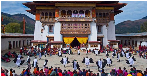
Black Necked Crane Festival

Experience and join the annual Black Necked Crane Festival celebrated at the courtyard of Gangtey Goenpa. A happy occasion for locals to rejoice and celebrate the arrival of the endangered bird, arranged to generate awareness and understanding of the important of conservation. Cultural programs such as folk songs, dances, marked performances